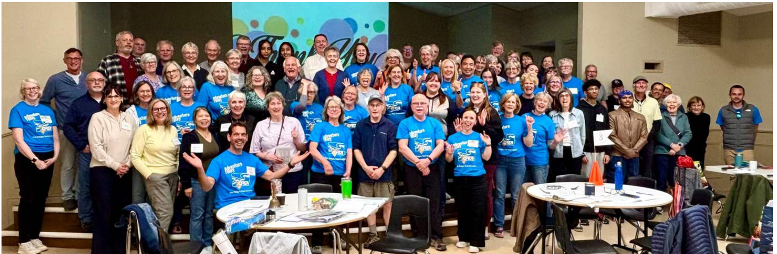
Photo taken at the Goodwood Community Centre during the Volunteer Training Session in advance of the event. ORTA members have embraced the Adventure Relay as a unifying experience and service to the wider community of outdoor enthusiasts on the Oak Ridges Moraine.

As is exceedingly obvious given the length of the race-day write-up above: none of this can happen without a deep roster of willing race-day volunteers. Staffing 16