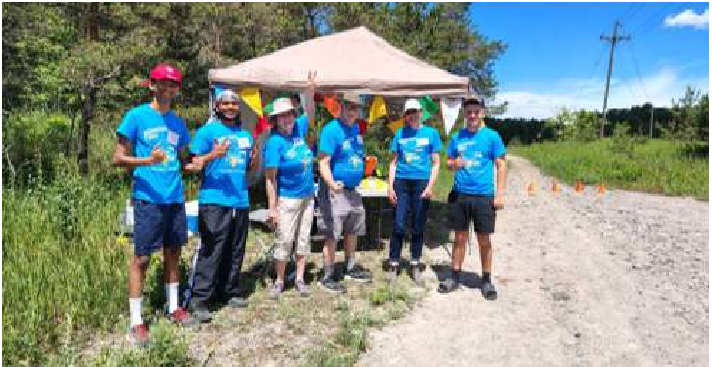
The Checkpoint 4-OUT team.