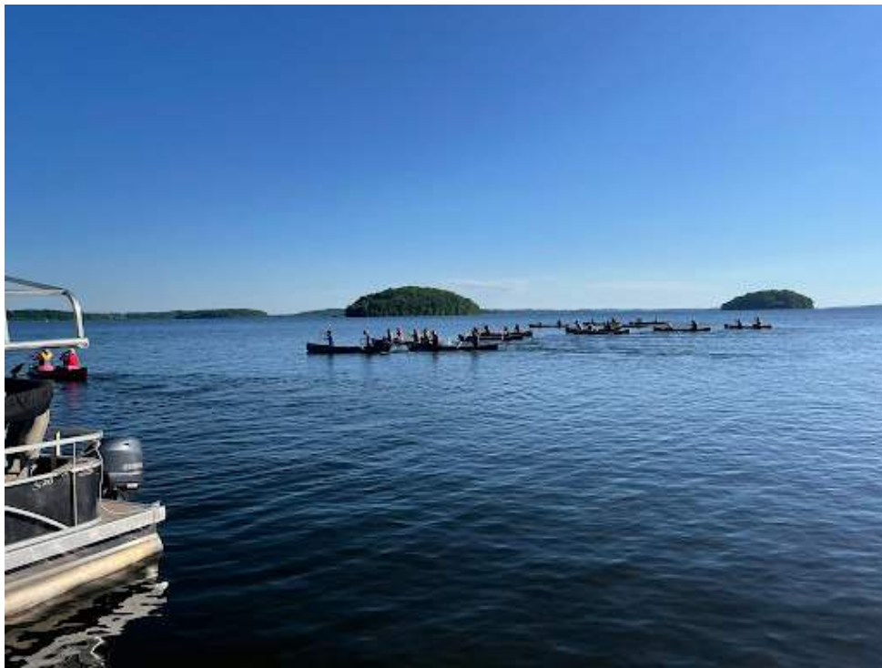
Canoists off to the races on a beautiful day for paddling!

The Oak Ridges Moraine Adventure Relay returned for its second consecutive year on June 13, 2026, and if the energy on course was any indication, this race is firmly back on its feet. The field this year wasn't the biggest the relay has ever seen, but it was a meaningful jump from 2025: fifteen full relay teams and five half relay teams (up from eleven and one in 2025, respectively) and a total of 183 racers took on the 14-stage course across the heart of the moraine, from the shores of Rice Lake all the way to the Aurora Family Leisure Complex. It was once again a beautiful weather day- clear skies and sunny all day across the moraine- which no doubt helped stoke the attitudes across the race course.