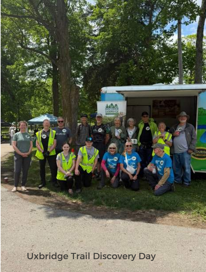
Uxbridge Trail Discovery Day