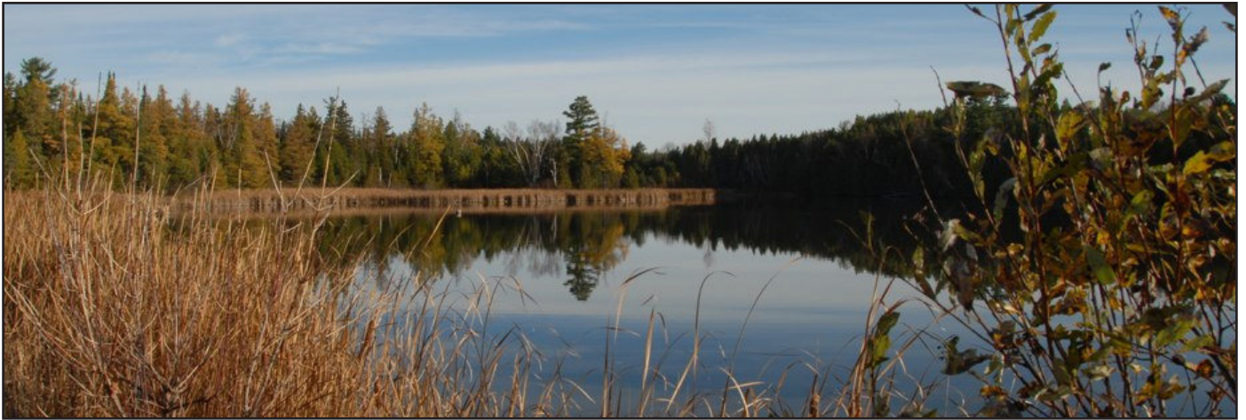
The Palgrave Millpond.

ORTA will soon celebrate the 25th anniversary of our beginnings in 1991. The Bruce Trail is in the midst of celebrating the 50th anniversary of its 1962-67 trail building. Why is the Bruce Trail so much older than ours? Surely they had a head start - the sediments that form the Niagara Escarpment were laid down more than 400 million years ago! The Oak Ridges Moraine formed a mere ten thousand years ago.