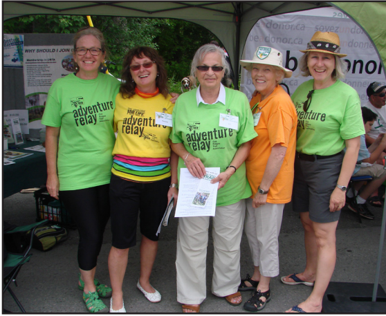
ORTA Volunteers at the Aurora Street Festival.

Summer arrives in Aurora with the annual Street Festival held on the first Sunday in June, rain or shine. The event is attended by throngs of visitors who parade along Yonge Street from Wellington to Murray Drive enjoying a variety of food and music. Vendors of all sorts are there, but many visitors come to learn about service groups and community activities.